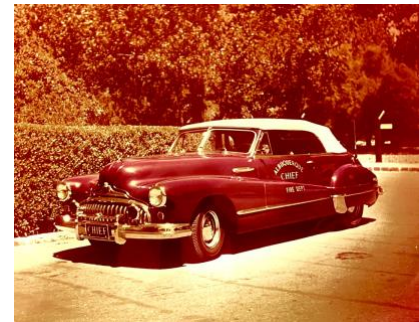
1941 Buick Roadmaster convertible.