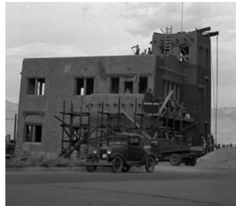
Original Fire Station number three. Built in 1936 with $60,000 from Works Progress Administration funds.

Albuquerque was a small town then and I think there were only 36 people in the Fire Department and only three Fire Stations. Fire Station # 1 was located at 2nd Street and Tijeras N.W. Station # 2 was at High and Silver SE and the old Fire Station #3 was at Monte Vista and Central Avenue N.E. At Station #1 there was Engine IA, which was a 1941 Seagrave Quad. It was a combination pumper and ladder truck. It had a full complement of ground ladders including a 50-foot Bangor, but no aerial ladder. It was much longer than a regular pumper and was very difficult to maneuver around city streets. There was Engine 1B, a 1927 American La France 750 GPM pumper, chain driven. This pumper was used for County firefighting because Bernalillo County didn't have a Fire Department then. Ladder #1 was a 1919, American LaFrance 75-foot aerial ladder truck with a tiller.