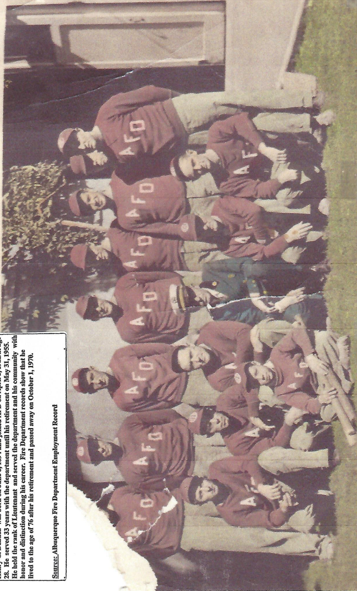
ALBUQUERQUE FIRE DEPARTMENT BASE BALL TEAM, (Circa, late 1920's)