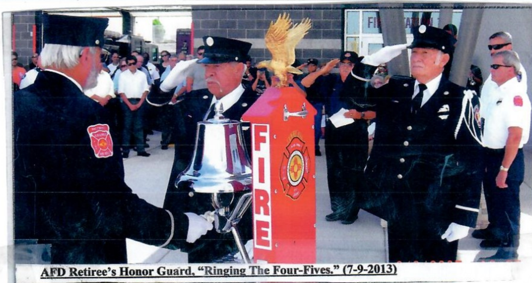
AFD Retiree's Honor Guard, "Ringing The Four-Fives." (7-9-2013)