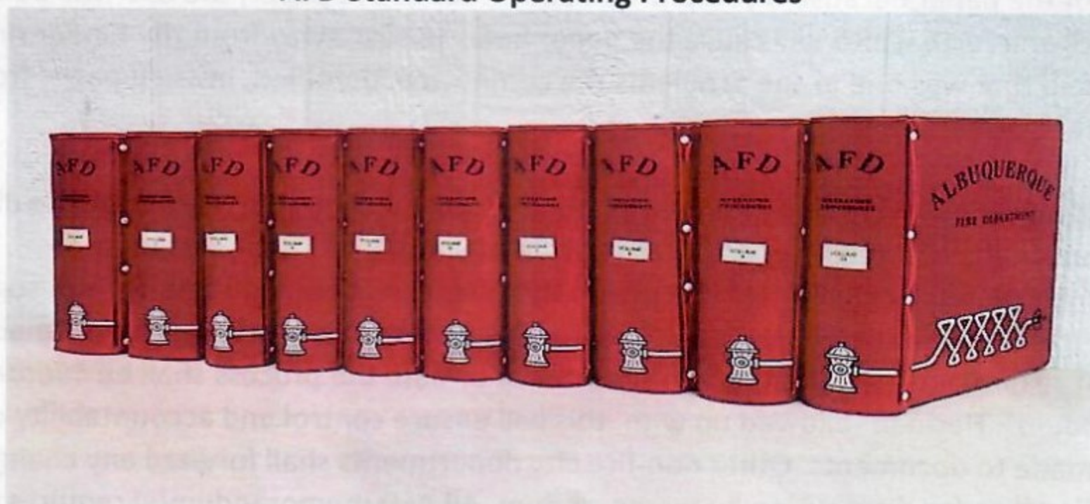
Red Books Volume 1 thru 10